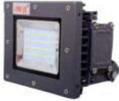
EX-FL 30W, 40W