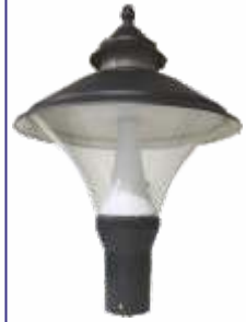
Upto 30 W