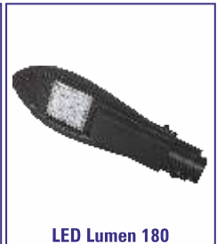
LED Lumen 180

DX-HB 100 W to 200 W Lens & Glasses 90° / 120°