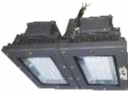
EX-HB 60W, 80W, 100W