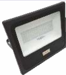
DSP-FL DC 100 W