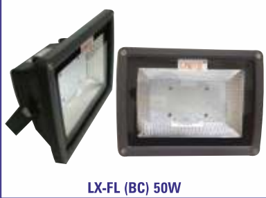
LX-FL (BC) 50W