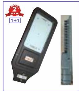
LX-ST 40W, 50W