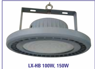
LX-HB 100W, 150W