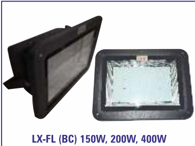
LX-FL (BC) 150W, 200W, 400W