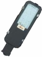
DSP-ST 25 / 30 W