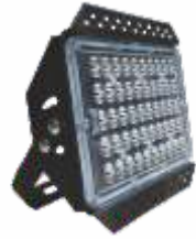
DSP-L-FL BC 40/50 W