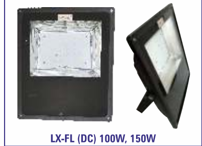
LX-FL (DC) 100W, 150W