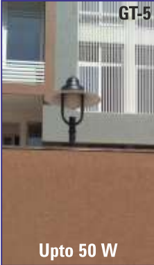
Upto 50 W