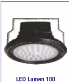
LED Lumen 180

Prinix Power (OPC) Pvt. Ltd. all product technical parameter \pm 5%