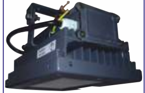
EX-HB 25W, 30W, 40W, 50W