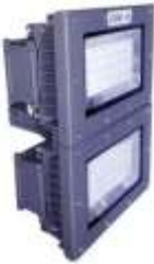
EX-FL 60W, 80W, 100W