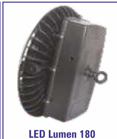
LED Lumen 180

DX-HB 100 W to 200 W Lens & Glasses 90° / 120°