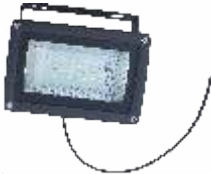
DSP-FL 25 / 30 W