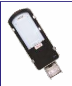
DX-ST 24W (Big), 30W

DX-ST 15W, 20W, 24W Prinix Power (OPC) Pvt. Ltd. all product technical parameter \pm 5\% LX-ST 25W, 30W