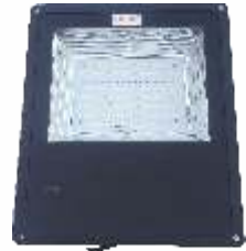
DSP-FL DC 150 W