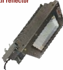
EX-ST 30W, 40W, 50W