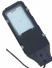
DSP-ST 36/40 W