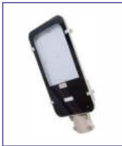
DX-ST 50W, 60W, 80W, 100W