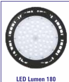
LED Lumen 180

DX-HB 100 W to 200 W Lens & Glasses 90° / 120°